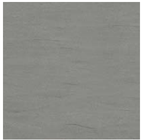
TITANIUM DARK Honed 18" x 36"