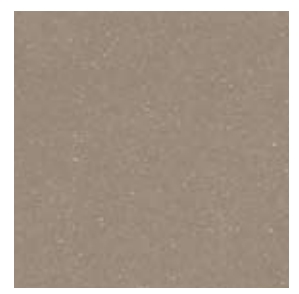
AVOCADO Sandblasted 24" x 24"