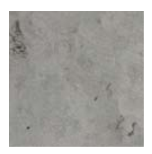
TITANIUM DARK Bush-Hammered 18" x 36"